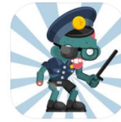
Math Vs Zombies Free (iOS) Free (Google)