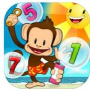
Monkey Math School Sunshine £1.99 (iOS) £1.79 (Google)