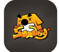
Sumdog Free (iOS) Free (Google)