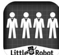
Operation Math Code Squad £2.99 (iOS) £2.69 (Google)